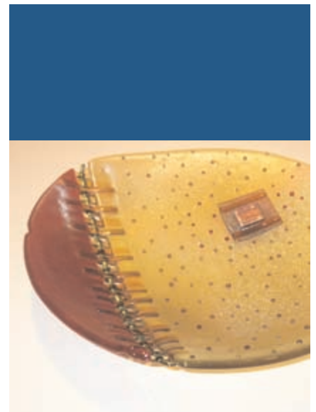
Jerry Harty Fused Glass January 6 – 30 Kingscott

AMBERLY ELEMENTARY SCHOOL ... for video, carvings, books and posters of Oazacan folk art of Mexico for use in fourth-grade classes.