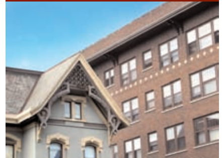
Larry Wolf Photography February 3 – April 28 WMU Unified Clinics