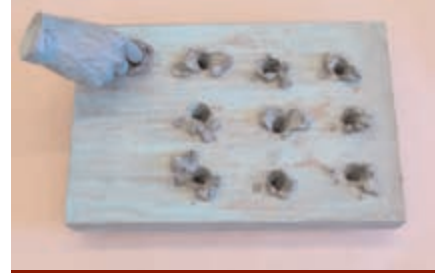
Paul Flickinger Drawings and Sculpture January 6 – 30 Arts Council