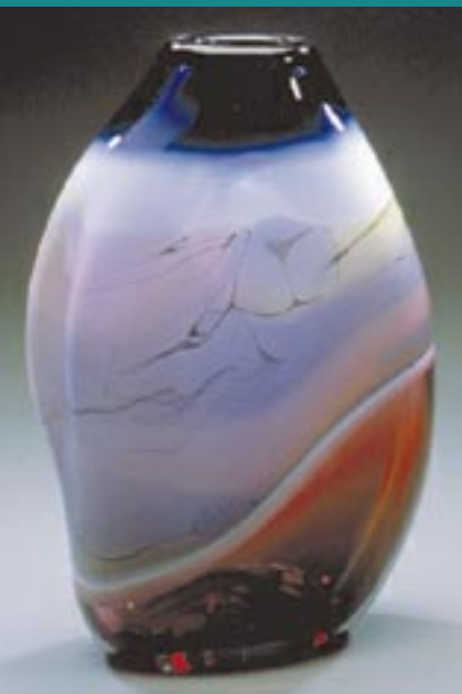
April Glass Month Exhibition Arts Council April 4 – April 30

The fourth annual Best 100 Communities for Music Education Survey is underway. The survey analyzes program specifics, class size, financial data, and a variety of other indicators to measure the overall quality of music education in a community. If you have a music education program that you would like to have considered for the Best 100 list, visit www.amc-music.org .