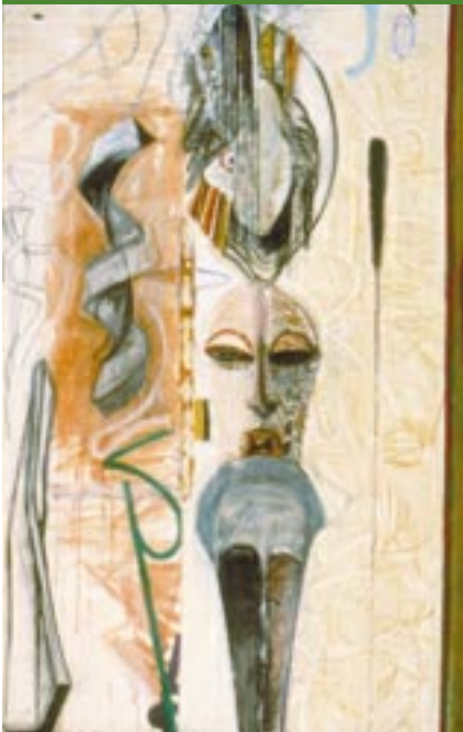
Artists and Writers Group Show Arts Council, May 2 – 31